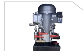
意大利阀，铜芯电机 Italian valve copper core motor