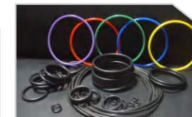
日本/意大利进口密封圈 Japanese / Italian oil seals