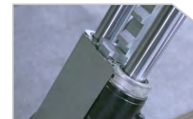
实芯钢X架气动机械保险锁 Solid plate X construction pneumatic mechanical safety