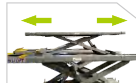
选配双边拉伸小剪 Optional both side extension