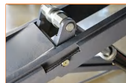
全新高强度合金助力臂，电脑3D动态模拟设计，满载下平稳下降。 High strength alloy auxiliary system, smooth decline at full loading which designed by dynamic 3D shape simulation