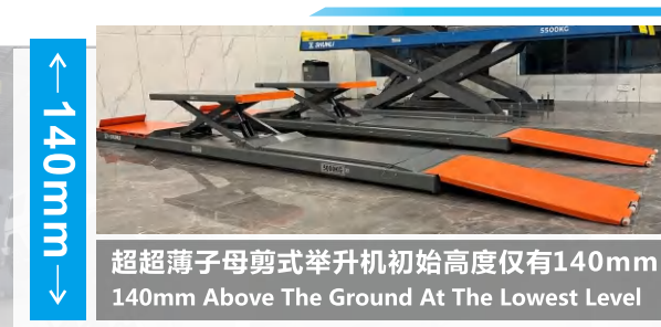
超超薄子母剪式升降机初始高度仅有140mm 140mm Above The Ground At The Lowest Level