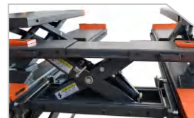
选配欧标二次举升小车 Optional the EU Standard Jack