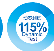
欧盟测试标准 the EU test standard