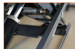
加厚实芯合金钢X架 Alloy solid plate X supporting arm