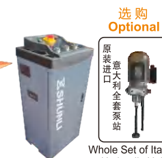
Whole Set of Italian Hydraulic Unit