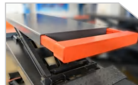
标配单边拉伸小剪 One side extension